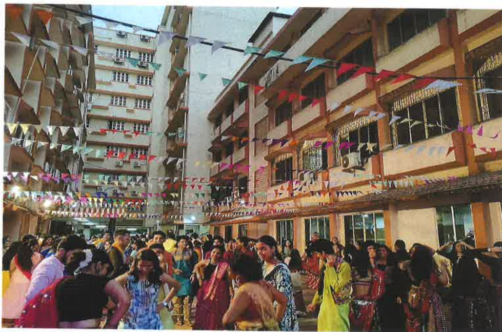
Students and Faculty enjoying the Garba Evening.

(Affiliated to University of Mumbai, Approved by BCI & Recognised by Govt. of Maharashtra) Accredited 'B+' Grade with CGPA 2.72 by NAAC (1st Cycle)