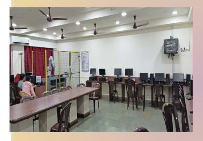
AUTOMATION AND ROBOTICS LABORATORY