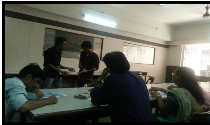
Ad Mad Show