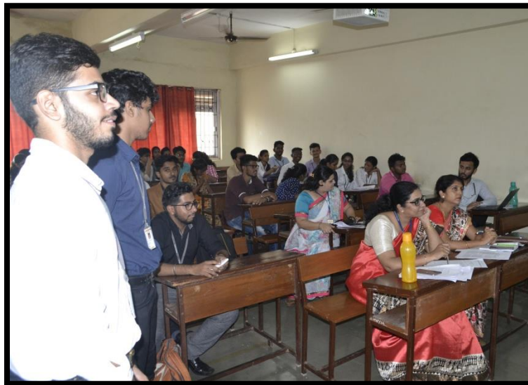
Technical Paper Presentation