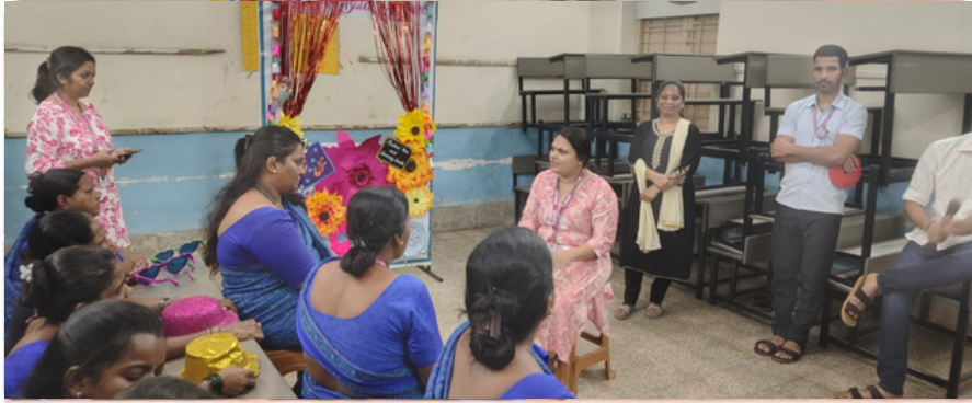
STRESS MANAGEMENT GUIDANCE FOR STAFF

THEME: YOU MATTER – SUPPORT, AWARENESS & TAKING THE FIRST STEP